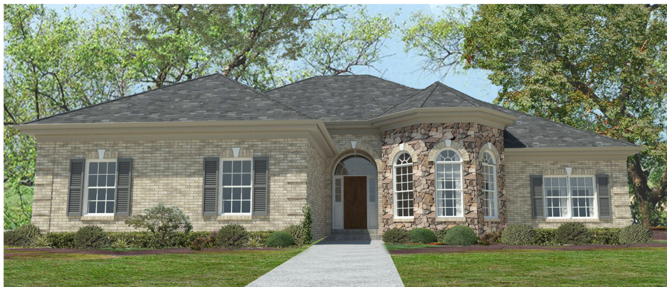
Lot 129 • Best Builders, Inc.